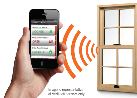
Image is representative of VeriLock sensors only.

Visit andersenhomedepot.com/connect for more information.